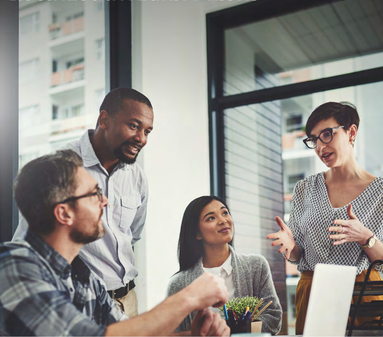
BUSINESS INTEGRITY RISKS COVERED UNDER THIS POLICY INCLUDE 5: