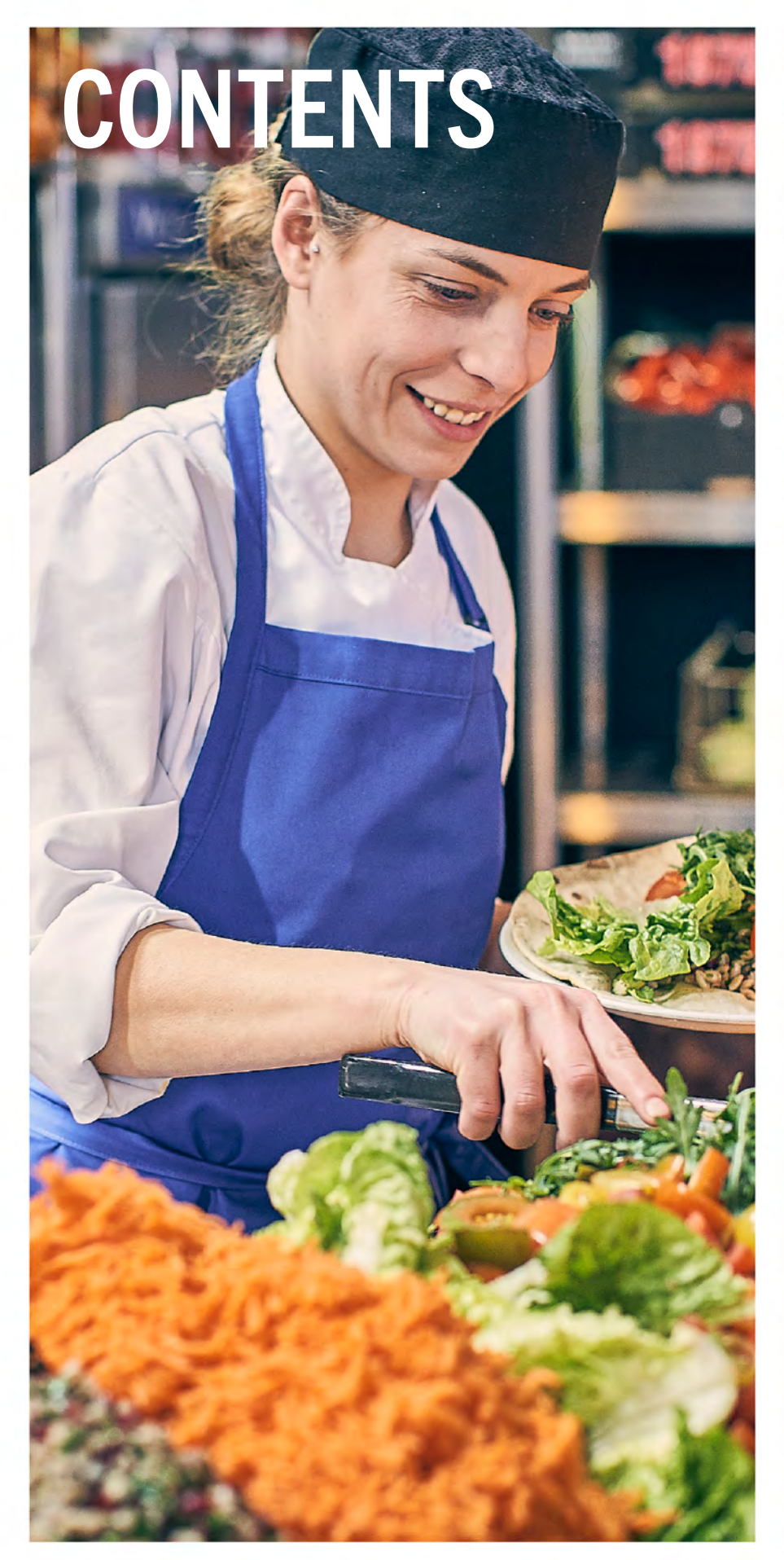
Compliance with this Business Integrity Policy (the policy) is mandatory and should be implemented in conjunction with the Code of Business Conduct. Failure to comply may result in disciplinary action up to and including dismissal. The policy sets out the minimum thresholds and standards that apply across Compass. This does not prevent a country or region applying more stringent thresholds and standards. If there is a difference between this policy, local policy and applicable laws, the strictest requirement must be applied. Where approval is required by Legal and no country Legal exists, you must obtain Regional General Counsel approval.